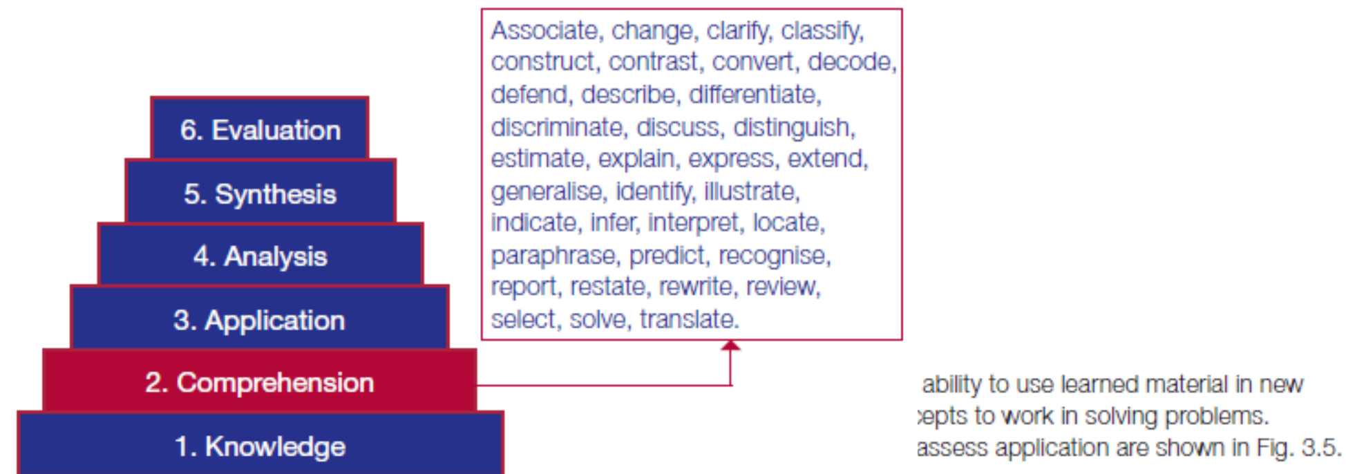
Fig. 3.4 Some action verbs used to assess comprehension

Comprehension may be defined as the ability to understand and interpret learned information. Some of the action verbs used to assess comprehension are shown in Fig. 3.4.